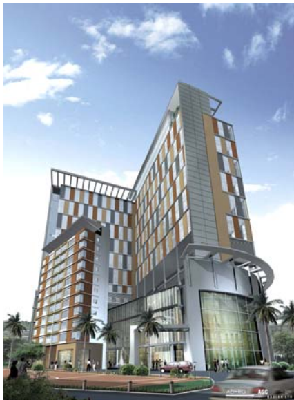
An artist's impression of planned Hotel School

Among the top 20 universities are 14 universi-