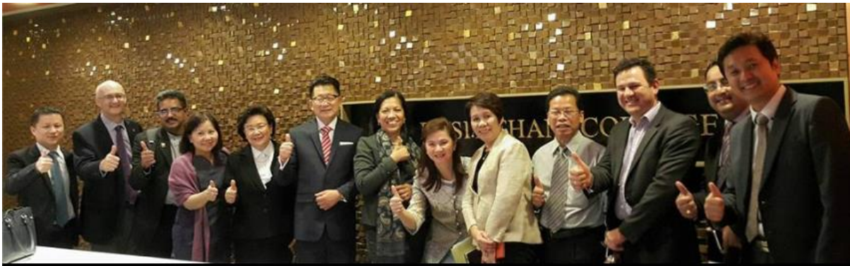
APacCHRIE Board shows a sign of approval for the Dusit Thani College Forum and Facilities

The board also experienced Thai hospitality of DTC with the Chinese Lauriat Lunch, Vietnamese dinner and the international buffet spread for the board meeting. The APacCHRIE Forum that is scheduled a day before the January board meeting has been a great opportunity for board members to share their experiences and knowledge with the conference host school, and has been practiced for a number of years already.