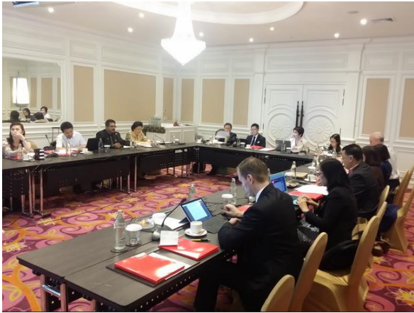
Great exchanges among the board members during the board meeting in Dusit Bangkok