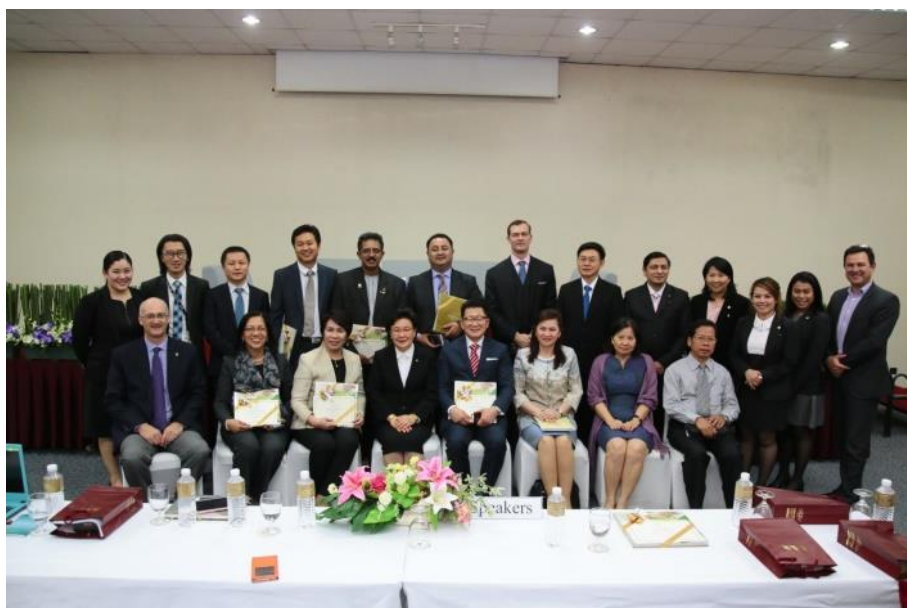
Dusit Thani College Organizers with APacCHRIE Board